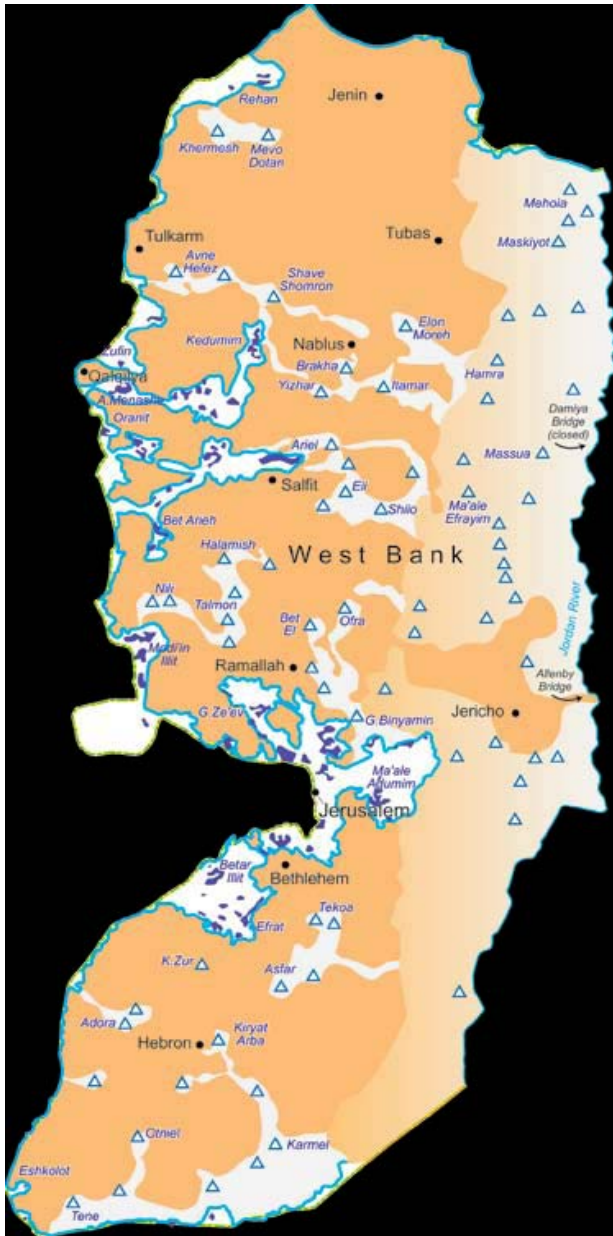
Map 2: The Separation Wall (blue line). None of the Palestinian West Bank is part of Israel under international law. However, the separation wall is not on the West Bank's border, but meanders deeply into Palestinian territory and puts large swaths (the areas in white) of the West Bank on the Israeli side of the Wall.