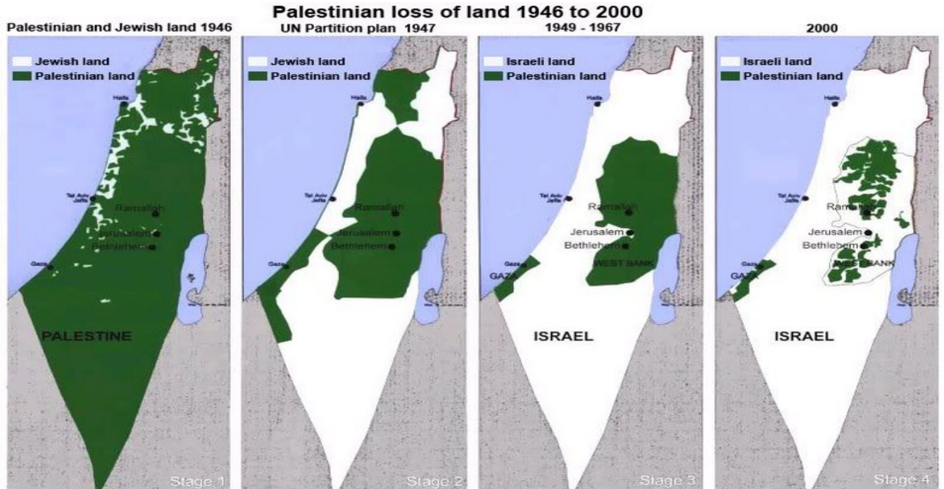
Map 4: Palestinian Loss of Land 1946-2010 The green area shows land under Palestinian control