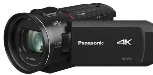
$800 Panasonic HC-VX1