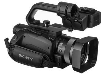
$1300 Sony HXR-NX88