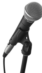
Vocal Mic Shure SM58