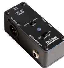
Direct Input for Guitars, Bass, Keyboard etc On-Stage DB200