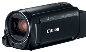
$250 Canon Vixia HF R800 Kit