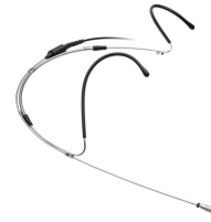
Headworn Wireless Sennheiser Speechline