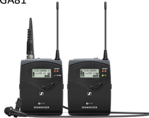
Wireless Lavalier Microphone Sennheiser ew100-g4